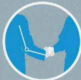
3) A GOOD SHAKE COMES FROM THE ELBOW. THE FOREARM REMAINS FIRM.