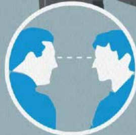
1) MAINTAIN EYE CONTACT.