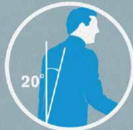
3) LEAN FORWARD ABOUT 20°.